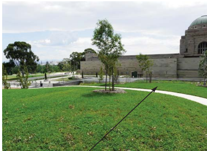
Proposed site of memorial

Since then, the Australian War Memorial has allocated land within its grounds for the construction of the memorial. The Society is working to secure the substantial sponsorships and gifts required to achieve this objective.