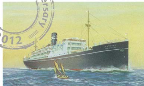
Rabaul & Montevideo Maru