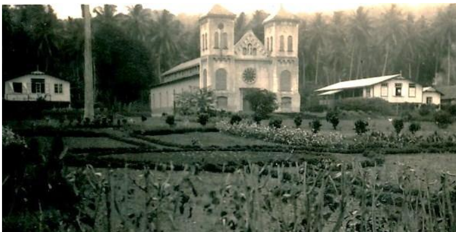
Catholic Mission, 1941

My mother and I often wondered if he actually was on the Montevideo Maru - or in the mass grave reportedly found after the war ended. However, several years ago I received a letter from an elderly Papua New Guinean (a pre-war friend) whose nephew was made to work on the wharf. The nephew, who also knew my dad, reported that he had seen and identified him as he was marched onto the boat. So I guess that brings closure.