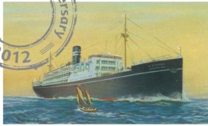
Rabaul & Montevideo Maru